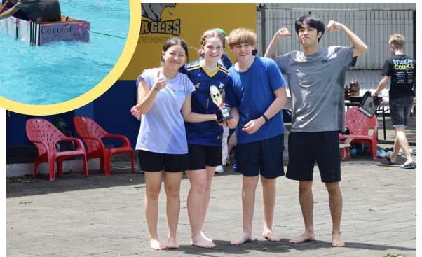
Sophomores win two awards with their boat, Coquette McQueen!