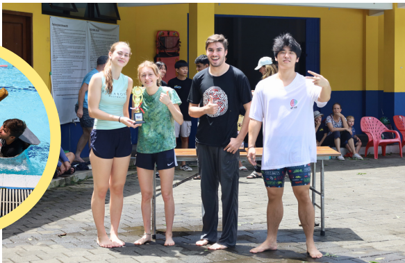
Seniors win "Titanic 2" award with Ellie the Narwhal