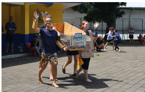
Juniors with Freddy the Shark