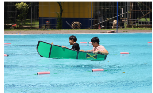
9th graders with Usain Boat