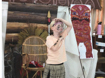
2nd Grade: New Zealand