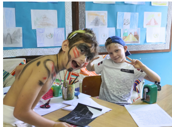
3rd Grade: Guatemala