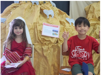
1st Grade: Turkey