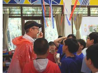
5th Grade: USA