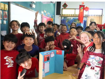
4th Grade: China