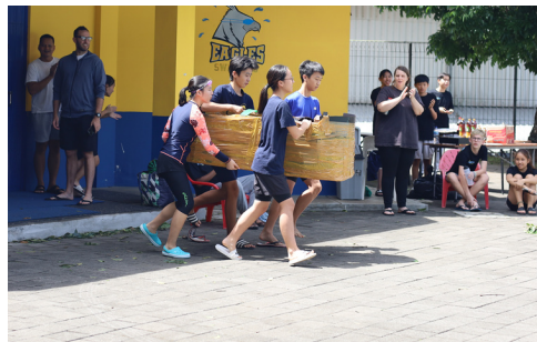
8th graders with Sinking Eagles