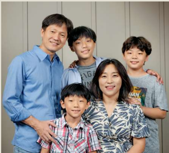
THE KIMS O*(■■■■)*